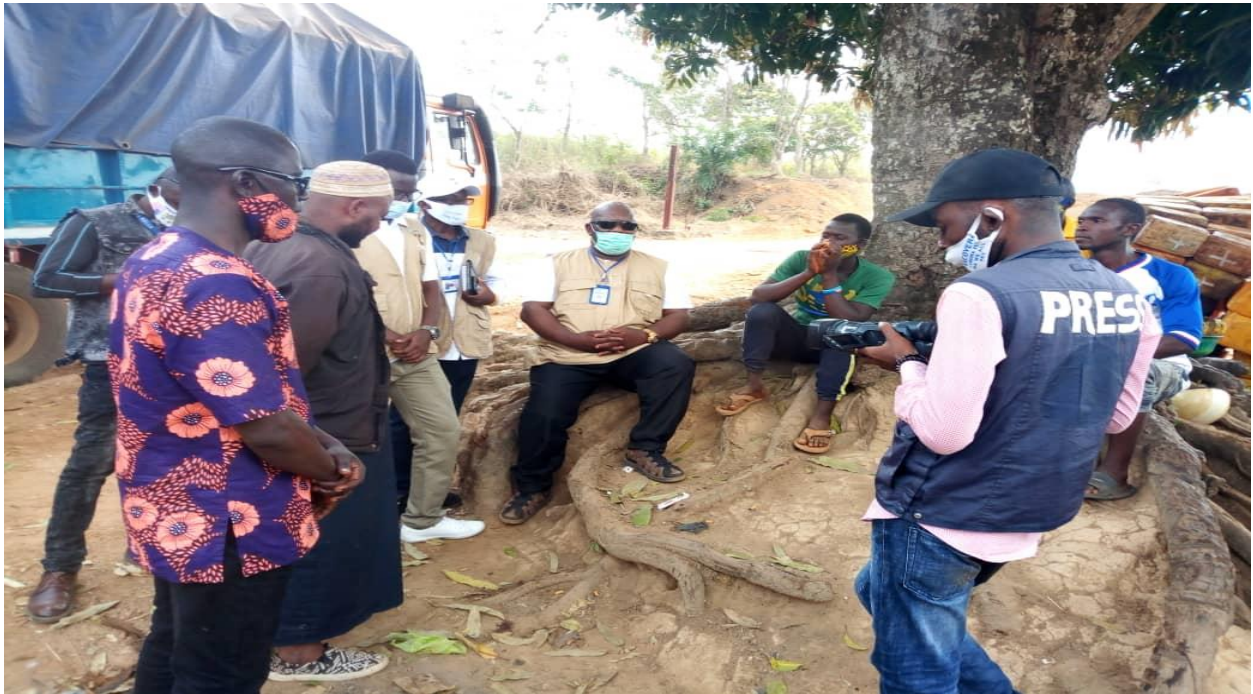
HRCSL mission met with traders and young people at the Sierra Leone crossing point