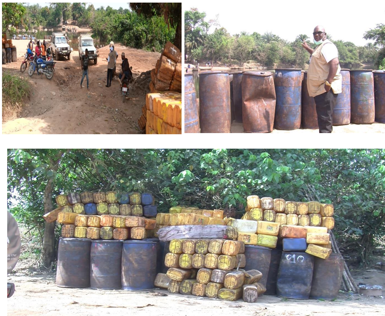
Photos: showing a halt on economic activities at the Sierra Leone Crossing point of the Makona River 300 metres away from Yenga

The HRCSL team also noted a large consignment of empty rubber containers and plastic jerry cans believed to be containers used in palm oil and fuel trade. HRCSL team took a tour around the sand beach and interacted with few young men who were hanging out at the crossing point waiting for unexpected opportunities for livelihood.