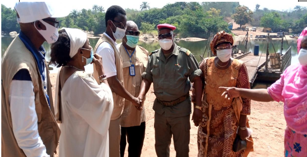
HRCSL TEAM AT THE SIERRA LEONE – GUINEA BORDER OF YENGA