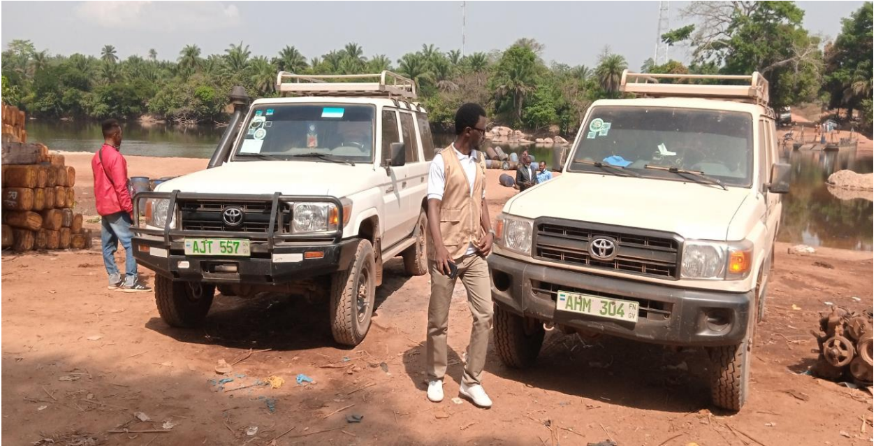
HRCSL Vice Chairperson tours the Sierra Leone crossing point