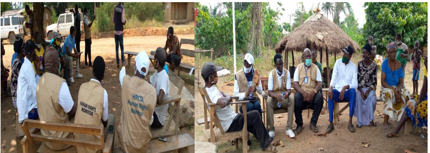
HRCSL team engaging the Town Chief and some residents of Yenga

The long-standing border crisis and recent disturbances that was circulated over the social media centered on the ownership of Yenga. Residents of this small community are the most affected in all conflict situations that have arisen over the control and ownership of Yenga.