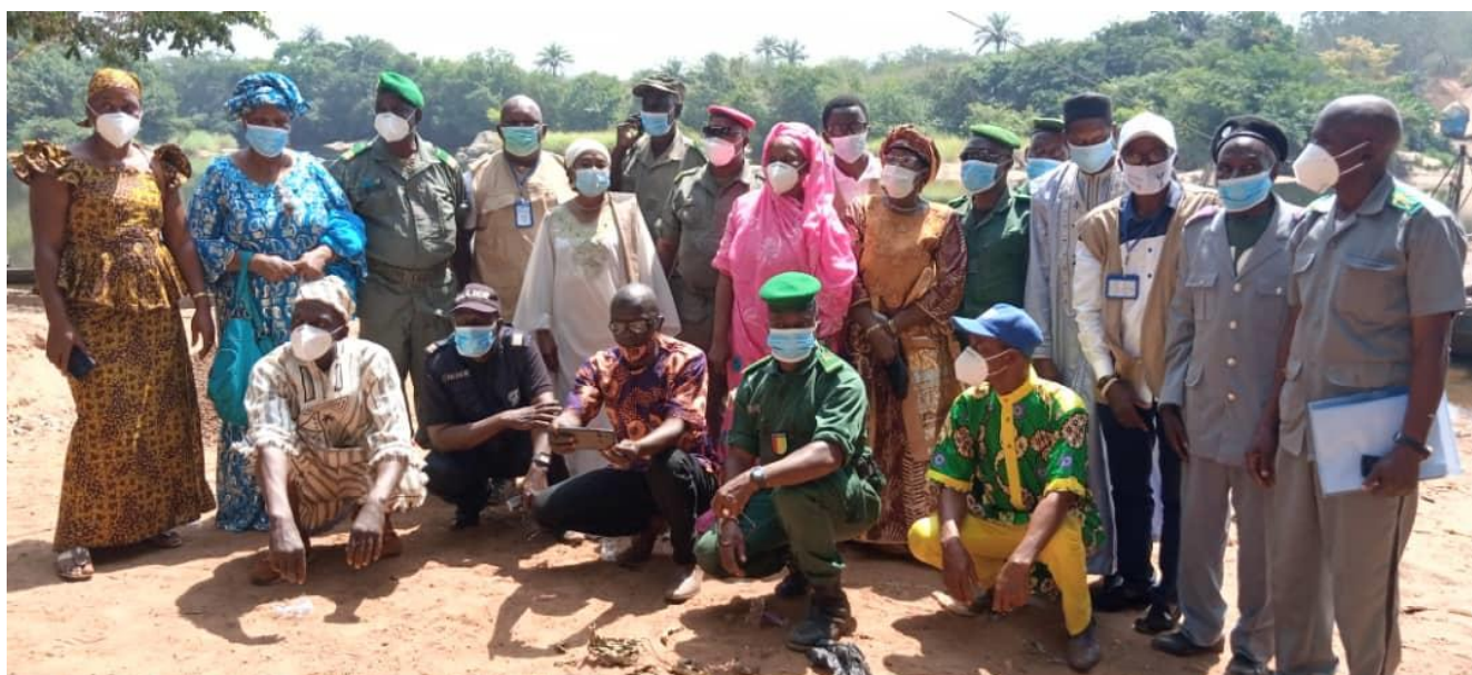
GROUP PHOTO - HRCSL team with the Guinean authorities and MRU delegation moments before departure to Sierra Leone