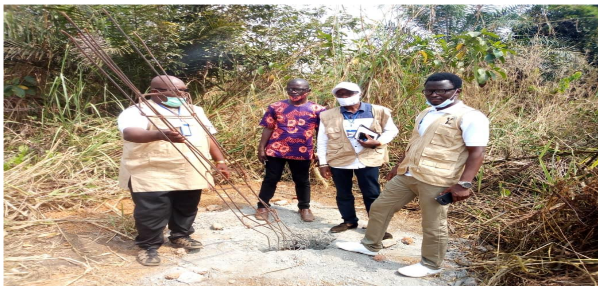
HRCSL team at the disputed site