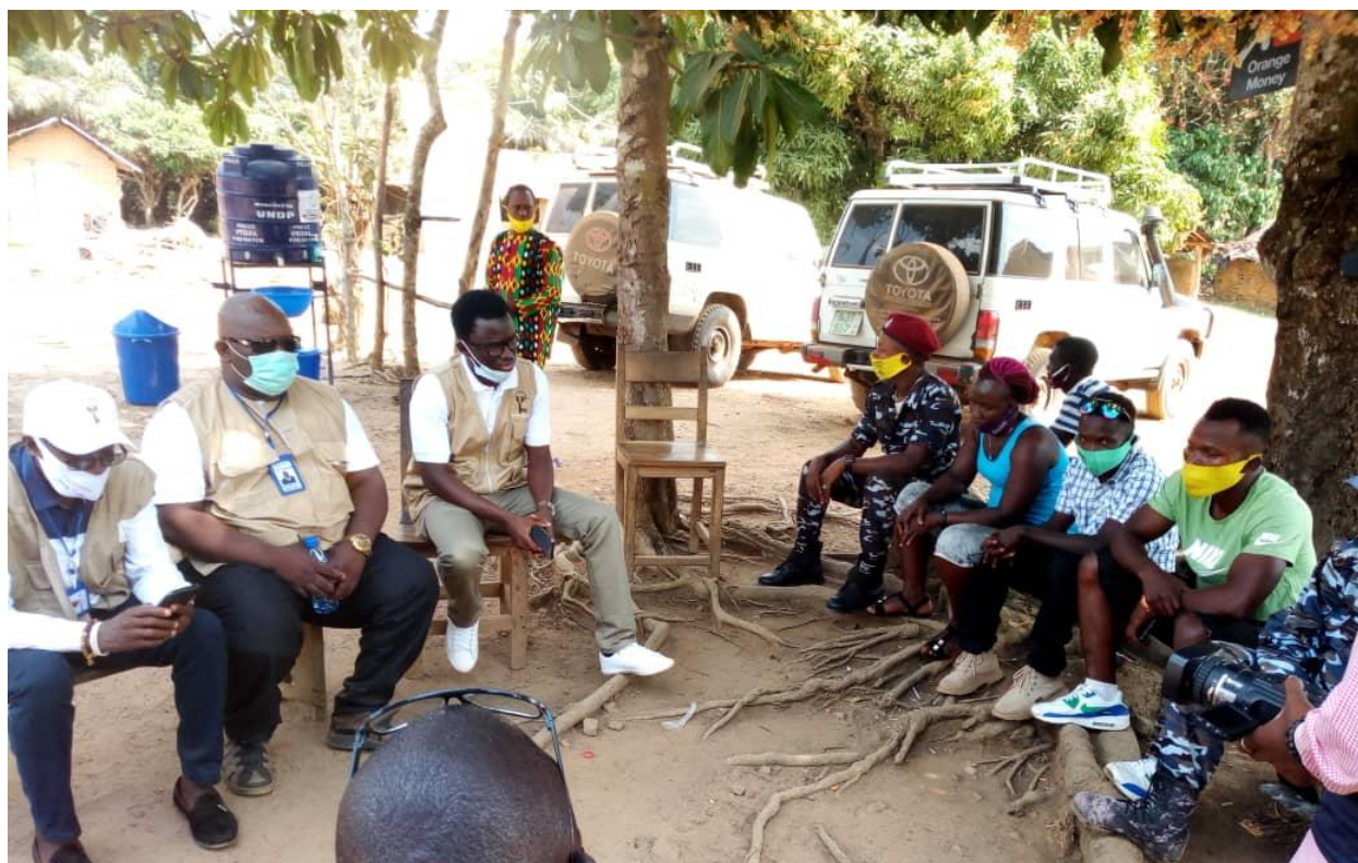
HRCSL team engaging the border security personnel at Pengu-Bengu

HRCSL team met with security personnel on the Sierra Leone side of the border at Pengu-Bengu Police Post. This border police post is a point of entry located about 2 kilometres from Koindu and five (5) miles away from the actual border (the Makona/Moa River) between Sierra Leone and Guinea. It was mounted to permanently provide security checks and to control the legal entry and exit point for persons in and out of Sierra Leone. The checkpoint is manned by joint forces from the Sierra Leone Police (SLP) and the Republic of Sierra Leone Armed Forces (RSLAF). HRCSL team also noted that personnel from other border related institutions such as Customs, Immigration and Health to name a few are stationed at the Pengu-Bengu border post.