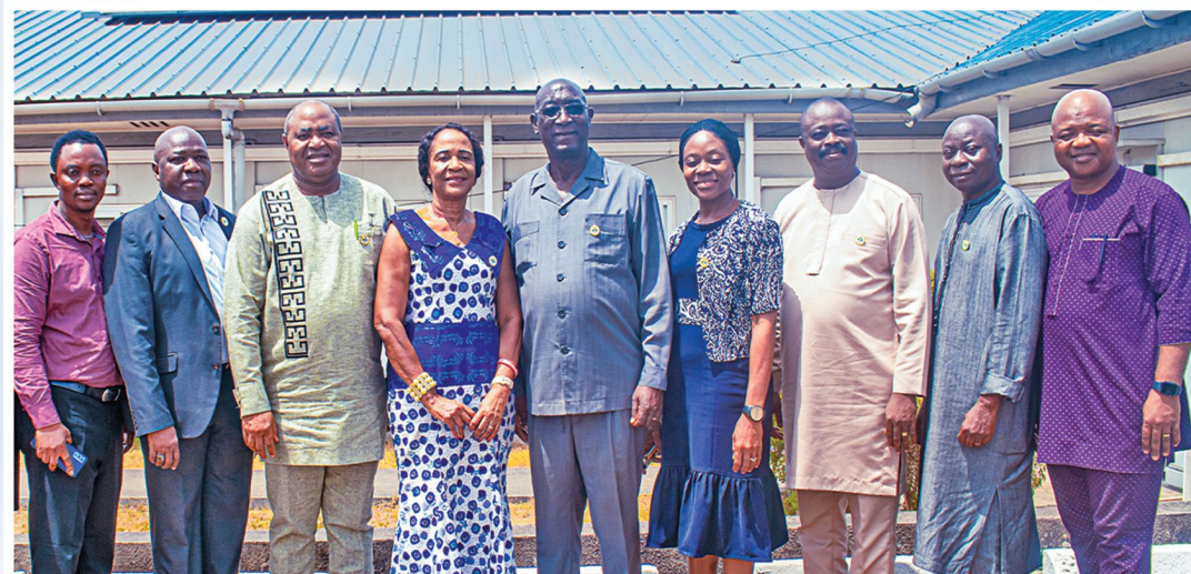
Cross Section of NPHA Board Members and Leadership